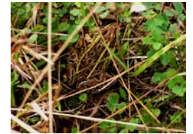
Northern Leopard Frog

Shallow Gilkey Lake and Little Gilkey Lake provide exceptional habitat for migrating and nesting waterfowl. Sandhill Cranes have been reported to be nesting in this area. The 2003 Michigan Breeding Bird Census reported 29 species of birds in this area.