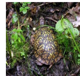
Eastern Box Turtle

This large area of open wetland and adjacent uplands are suitable habitat for a number of species of concern such as the Eastern box turtle. Eight of the eleven