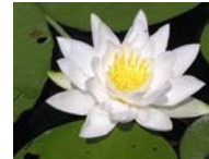
Scented Water Lily

The larger wetland basin includes emergent marsh communities with abundant sweet scented water lily. The largest habitat, southern wet meadow, occurs along both lake perimeters.